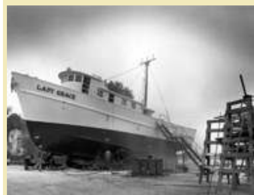
Trawler Lady Grace. Second steel trawler built by Beaufort Industrial Marine Company Inc., Lady's Island, 1969.

Domestic production could no longer keep up with demand, so the U.S. started to depend more and more on imported shrimp. Food distribution was changing, too,