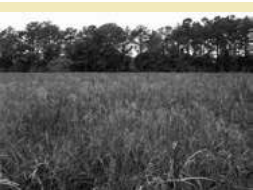
Carolina Gold Rice at Turnbridge Plantation Hampton County, South Carolina

FOR MORE INFORMATION: Carolina Gold Rice Foundation www.carolinagoldricefoundation.org