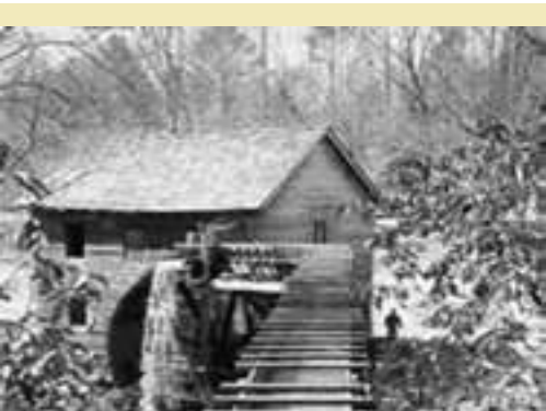
Hagood Mill, Pickens County, SC

Nothing was wasted. Not only did corn provide feed for family and farm animals, but even the corn shucks were used by the industrious to make