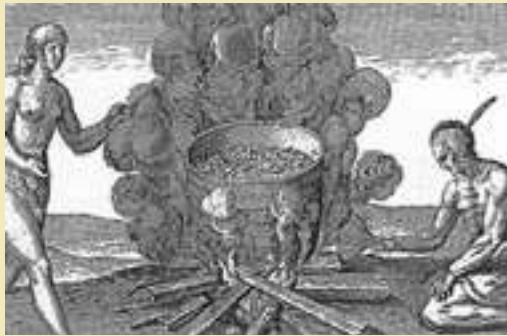
Natives on the Carolina Coast, 1585. Engraving by John White.

unmeasured and rely on the expertise and taste of the cook. A "pinch of this" or a "pinch of that" are measures that are left to the skill of the cook and the natural way these traditions are passed from generation to generation. Some delicacies – like "possum and chestnuts" – are seldom prepared by the new generation of cooks, yet memories of the dish have lasting resonance in the region.