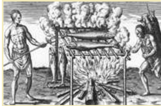
Natives and "barbacoa" on the Carolina Coast, 1585. Engraving by John White.

Today, the Cherokee's mode of life is much like others, though some differences remain. Traditional Indian foods like greens, "fried corn," hominy, sweet potato pie, bear meat, rabbit, and bean bread are still found on their dinner tables. The Cherokees of South Carolina never forgot what their forefathers gave them – their culture and Cherokee heritage. During the 1800s and early 1900s, most of the meats eaten by the Cherokee people were obtained through hunting. They hunted many forms of wildlife including birds, deer, ducks, geese, pheasant, possum, rabbit, squirrel and wild turkey. Many also raised their own cattle, chickens, and hogs. Fish was also one of their main foods. Even today, many Native Americans hunt on a regular basis and maintain farms.