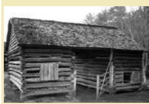
Typical double-pen corn crib, Pickens County, South Carolina

At the end of a long, hard day’s work, the farmer could fill his corncob pipe, sit by the fire in his favorite cornshuck seat chair and rest his feet on the braided cornshuck rug. He could watch his little girls play with their cornshuck dolls and help his boy make flying toys from corn cobs and feathers to throw from the loft of the barn the next day. If he had the foresight he could take some corn