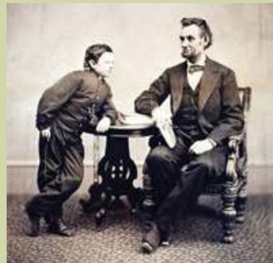
The photograph of President Lincoln and his son Tad was on display at the South Carolina Confederate Relic Room and Military Museum as part of the exhibit Civil War Photographs from the David L. Hack Collection