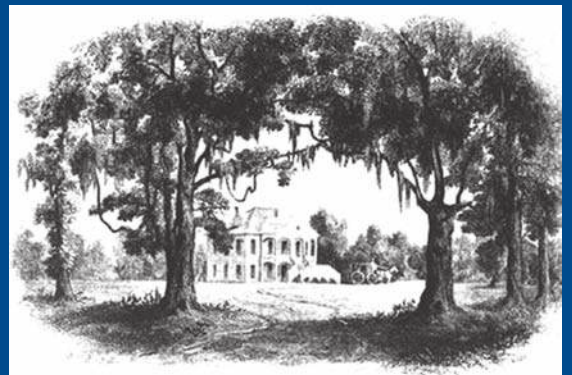
Woodlands Plantation as depicted in 1843 by T. Addison Richards.

With an extraordinary collection of historic images and documents, oral histories, as well as family photographs, "home movie" film footage, and "home video" footage, this unique program documents the living descendants' efforts to examine the persistence of the relationship and expose the myths that sustained the connection through more than two centuries.